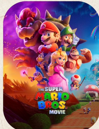
FRIDAY, AUGUST 28