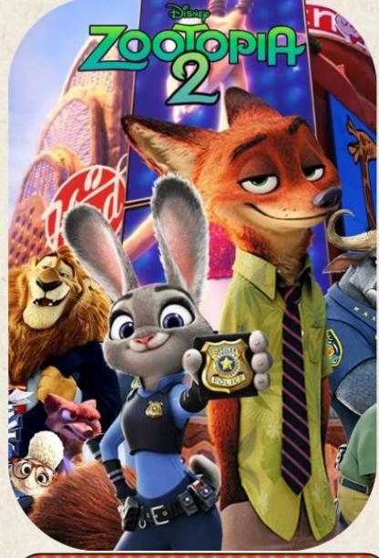
FRIDAY, JULY 17