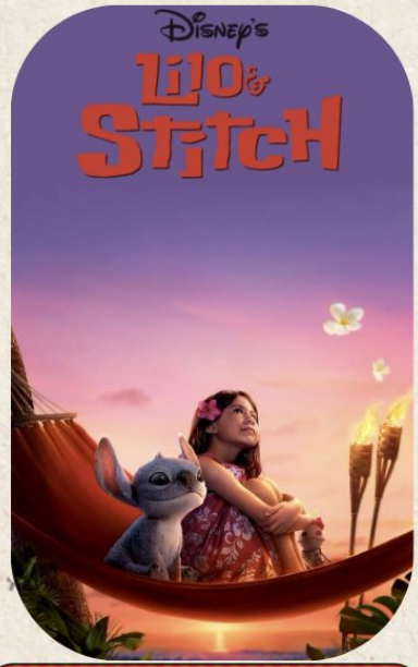
FRIDAY, JUNE 19