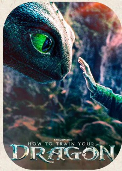
FRIDAY, JULY 31